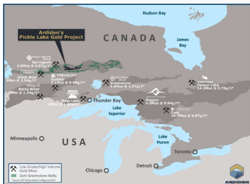
Figure 1– Location of Ardiden's Pickle Lake Gold project within the Uchi Belt of northwest Ontario 1 .

Ardiden Limited ('Ardiden' or 'the Company') (ASX: ADV) is pleased to report on its Quarterly Activities at its highly prospective 100% owned Pickle Lake Gold Project in Northwest Ontario, Canada. Ardiden's strategic landholding is situated on the same geological belt as Red Lake, the 'Uchi' Subprovince, which has produced over 30M oz of gold to date. (Figure 1).