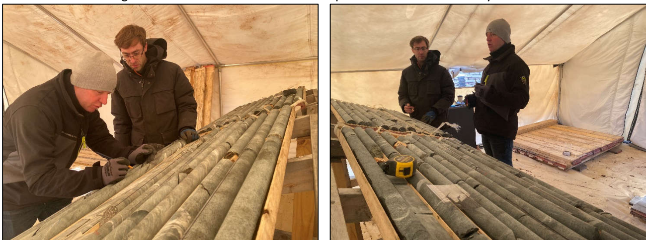
Figure 4- Structural analysis and re-logging drill core at Ardiden's Core Storage Facility

During the quarter the Company conducted a geological review of the recently drilled Kasagiminnis diamond drill core with all 21 drill holes included into this program. The first hole conducted was KAS-20-01 where all structural measurements were re-logged including all faults and shear zones, vein structures with their orientation and alterations zones. Once completed, a re-sampling program was undertaken to analyse all highly prospective drill core that was previously not sampled. A total of 43 half core samples were cut and processed with the standard QAQC protocol before being sent to the laboratory for fire assay Au (gold) and multi element geochemistry analysis to be conducted. Assay results are anticipated Q1 2022 but some delays unfortunately continue across laboratories in Ontario due to increased volumes seen in late 2021, combined with reduced available staff. Adding to this is the current increase in exploration activities already observed in 2022.