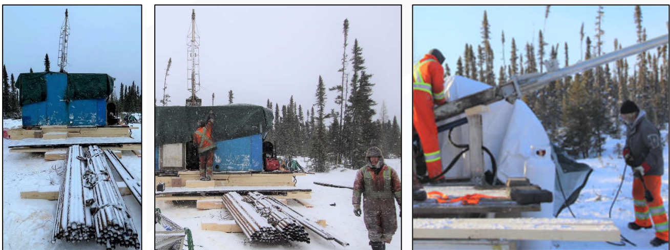
Figure 3-Drilling Underway at the Esker Gold Prospect