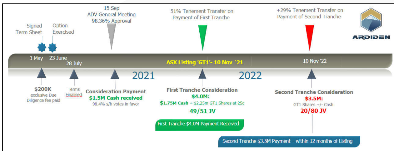
Figure 7- Tranche Payments and Timeline with GT1 Lithium Joint Venture

Ardiden will retain 20% Project and production ownership should GT1 elect to increase to 80% and will retain 9m GT1 shares, currently valued at $7.5M.