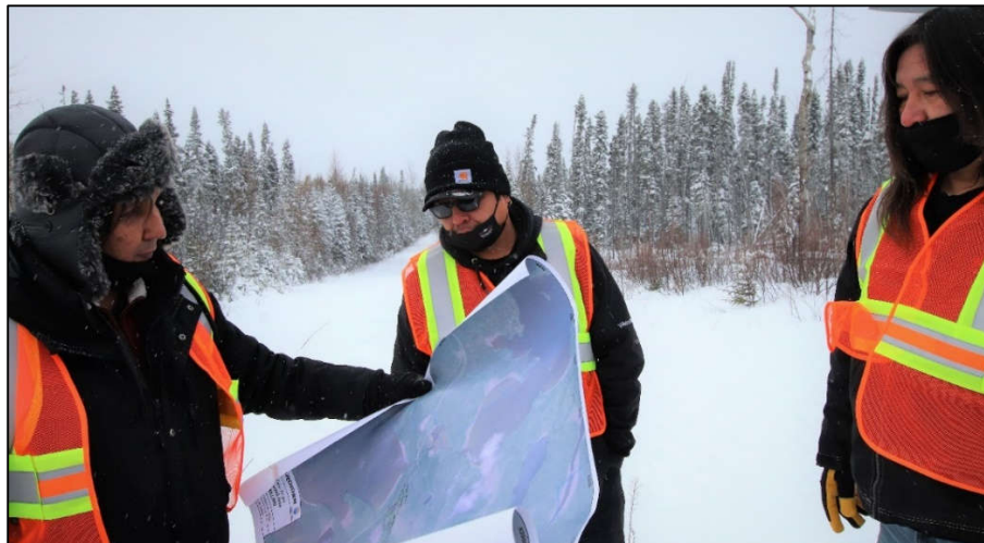
Figure 6-Ardiden reviewing planned drill holes at Esker with the Chief and Land users of the Mishkeegogamang First Nations

The Company conducted a site visit to the recently granted Esker Exploration Permit area with the Chief and traditional land users from the Mishkeegogamang. The visit was part of a site review in drill planning and understanding any sensitive areas within the permit area.