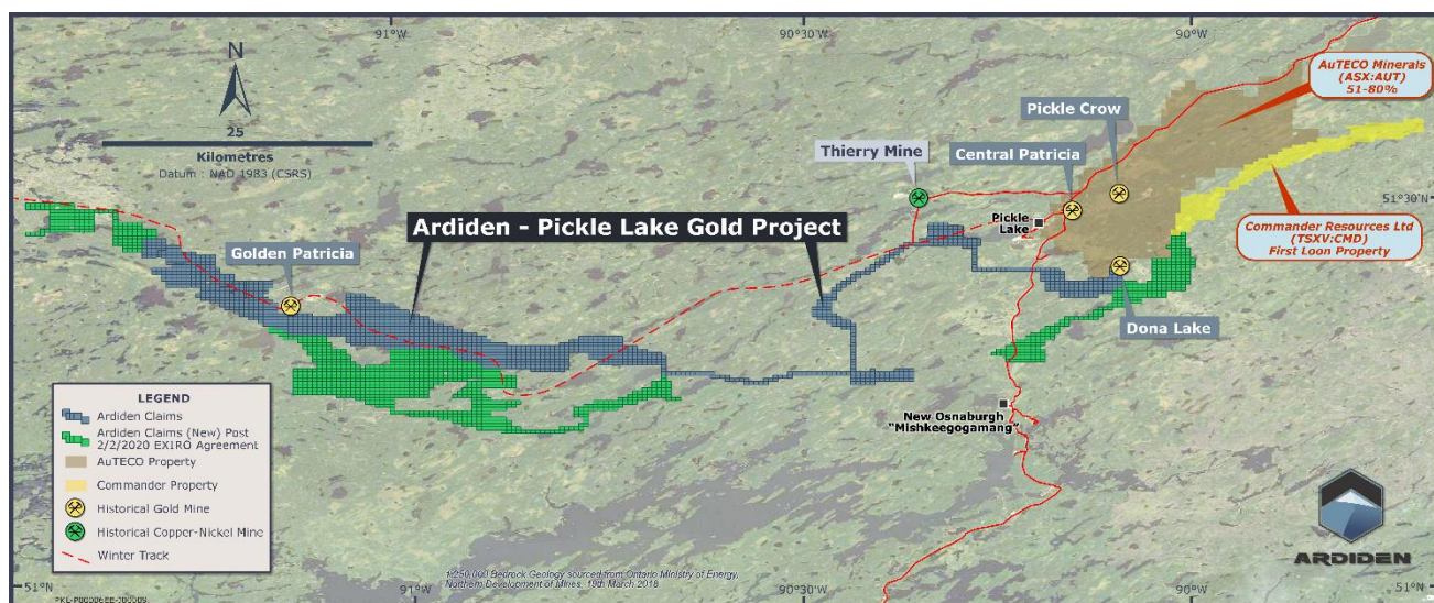
Figure 4 – Ardiden's Pickle Lake Gold Tenements showing existing and new claims