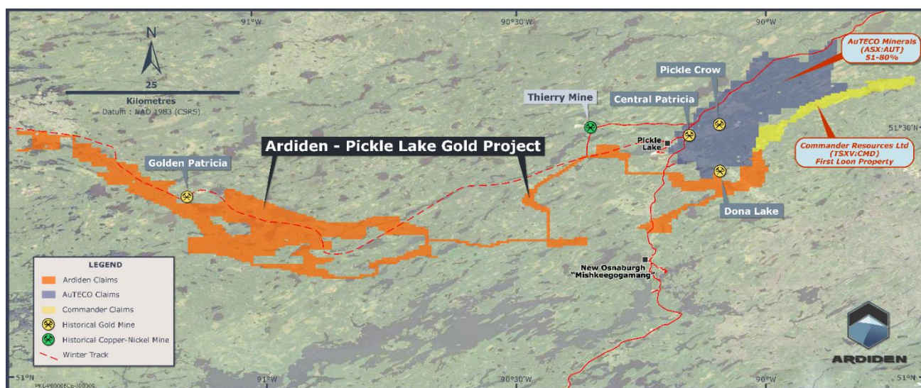
Figure 1 – Ardiden's Pickle Lake Gold Tenements showing existing and new claims

"The ground holding now extends over more than 100km of highly prospective Archean greenstone territory that provides us the best opportunity to make new and exciting discoveries. What is significant about the increased landholding is the potential of the overall belt as one of the best jurisdictions in which to invest and explore for new high-grade gold deposits using modern exploration techniques and geophysical analysis - we are very excited about what the future holds."