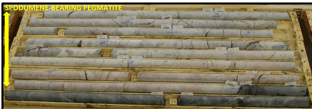
Figure 1. Drill core obtained from drill hole SL-17-37 showing the intersection of high-quality spodumene-bearing pegmatite (the lighter coloured material in the photo is the Pegmatite, whilst the darker material is Mafic Volcanic).

The latest drilling has continued to validate the northern extension of the known primary mineralised zones, further expanding the boundaries of the main outcropping area and extensions of the secondary spodumene-bearing pegmatites at the project. Once the drill core has been logged, cut and prepared, the drill samples will be sent to Activation Laboratories in Thunder Bay for assay.