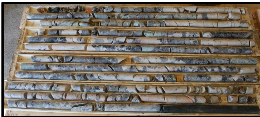
Figure 1. Drill core obtained from drill hole SL-17-04 showing the 12.45m intersection of high-quality spodumene-bearing pegmatite.

The latest results continue to verify the presence of multiple thick zones of high-grade lithium mineralisation located either at or close to surface, with the recent drilling confirming the presence of secondary, stacked and parallel, mineralised sills in a number of holes at the North Aubry prospect.