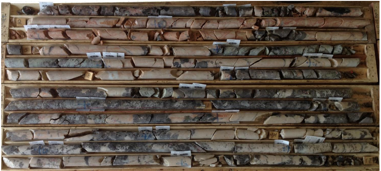
Figure 2. Drill core from diamond drill hole SL-17-02 showing high quality spodumene mineralisation from 0m to 17m.

The identification of pegmatites either at or close to surface represents a strategic advantage for the project, potentially allowing easier access to high-quality mineralisation in a future mining scenario. The proximity of the pegmatites to surface is likely to reduce the required pre-strip, resulting in a lower extraction cost and therefore improved project economics.