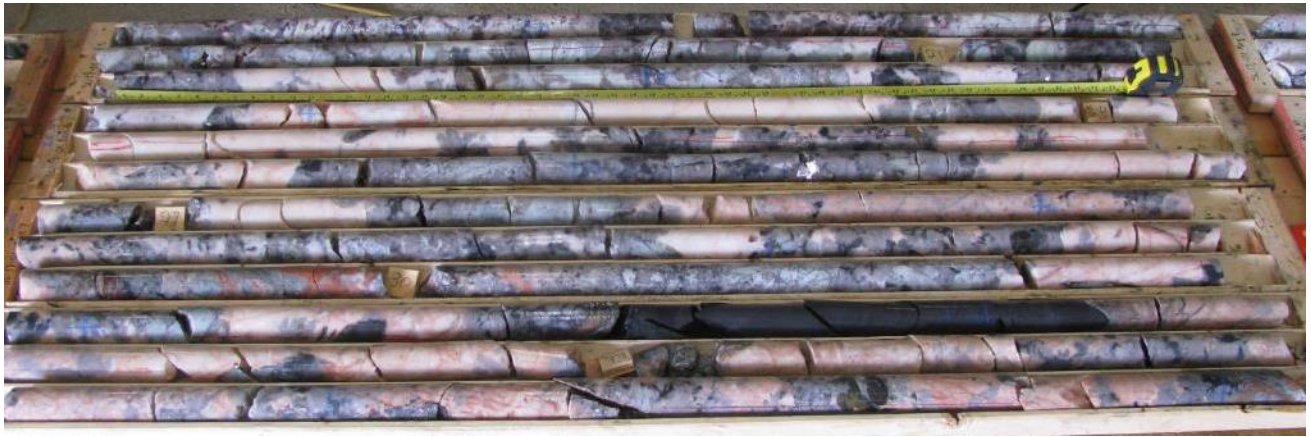
Figure 1. Drill core from diamond drill hole SL-17-01 showing high quality spodumene mineralisation from 18.4m to 34m.