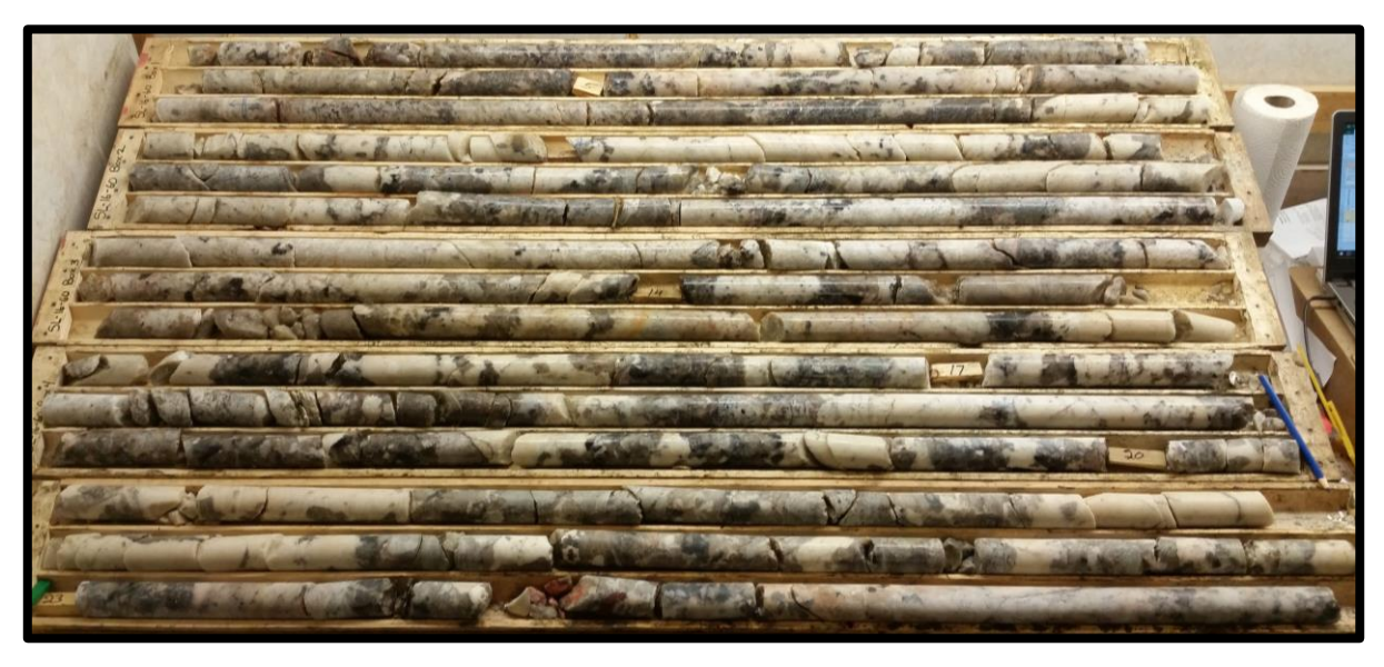
Figure 2. Drill core obtained from hole SL-16-60 showing a portion of the 23.5m intersection of high quality spodumene-bearing pegmatite.

The significant potential of the North Aubry prospect is highlighted by drill-hole SL-16-58, which intersected an impressive 12.24 continuous metres of spodumene mineralisation close to surface with an average lithium grade of 1.99% Li<sub>2</sub>O . Drill-hole SL-16-60 intersected 23.47 continuous metres of spodumene mineralisation with an average grade of 1.23% Li<sub>2</sub>O (refer to Table 2 below).