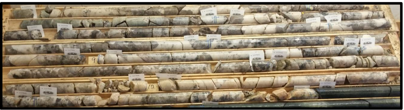
Figure 1. Drill core obtained from drill hole SL-16-58 showing the 12.2m intersection of high quality spodumene-bearing pegmatite.

Ardiden confirms that an additional 71 samples of the total 457 drill core samples from the program have now been received from Actlabs laboratory in Thunder Bay. The results, from drill holes SL-16-55 and SL-16-60, have confirmed the presence of significant lithium mineralisation at various grades in all 71 samples, with significant assay grades of up to 6.01% Li<sub>2</sub>O (drill hole SL-16-58) identified.