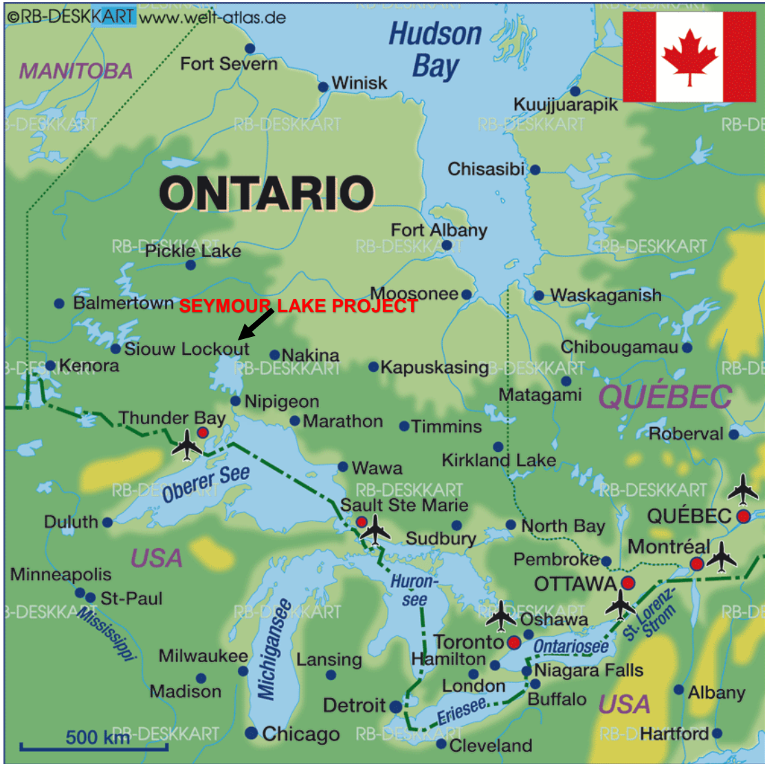
Figure 2: Location of Seymour Lake Project (approximately 230km north-northeast of Thunder Bay)

The upcoming drilling program is the key component of the Company's due diligence review of the project.