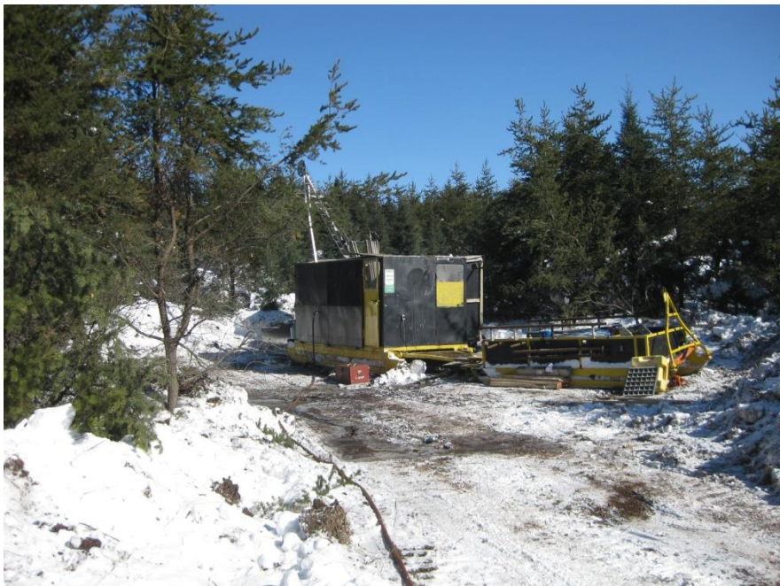
Figure 1: Drill rig commencing maiden 1,000m diamond drilling program at Manitouwadge graphite project in Ontario, Canada

Testwork undertaken during the due diligence period indicated that simple, low cost gravity and flotation beneficiation techniques can result in graphite purity levels of up to 94.8% for jumbo flake and 94.0% for large flake.